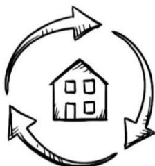
RETURN ON INVESTMENT

Making upgrades can be as easy as replacing the handset on your front door and freshening up the paint job, or as daunting as remodeling an entire kitchen or master bath. The question always is, what home improvements give the best return on the remodeling dollar?